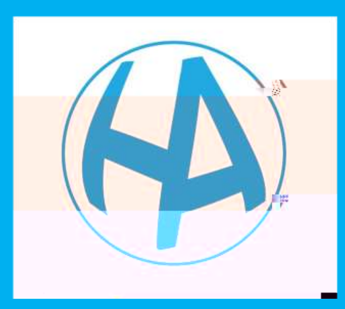
INSPIRING INDIVIDUALS, TRANSFORMING COMMUNITIES